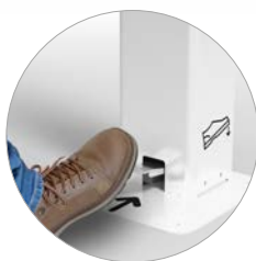
Foot activated dispenser