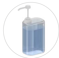
For 5 litre bottle