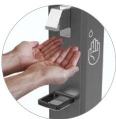
Removable tray to collect excess gel