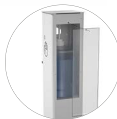
Easy to replace the gel bottle